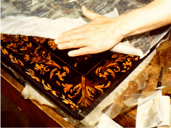
Picture from the article on glue rehydration : “Current Trends in Conservation of Marquetry Surfaces”

Glue reversibility is essential when working with veneers, inlay and marquetry surfaces. It is necessary to be able to glue and unglue veneers while building a pattern on the surface. Protein glues allow easy repair and replacement of damaged veneers, by using heat and moisture. The glues are easy to clean off the surface, either with water or sanding, and are not affected by stains, solvents and finishes. Thinned animal glue mixed with sawdust makes a good mastic for marquetry.