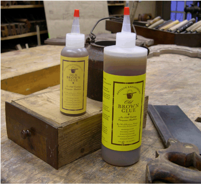
An example of urea modified Liquid Hide Glue. W. Patrick Edwards' Old Brown Glue .

All of these additives reduce the actual strength of the glue somewhat, but the final result is still an adhesive which is stronger than the wood surface. All protein glues contain some preservatives and foam control agents, which do not affect their working characteristics.