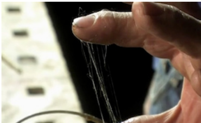
Video from www.woodtrek.com Hide (& Animal Protein) Glues: Background, Selection and How to Prepare

Traditional woodworkers used subjective tests to monitor the hot glue as it cooked. The odor should be pleasant if the glue is good, and smell bad if the glue is overheated or has been damaged by mold. The viscosity is measured by lifting the glue brush about a foot over the pot and letting the glue drip back down. It should be thin and liquid, with no lumps. You can test the strength by putting a small amount of hot glue between your finger and thumb, and rubbing together until it cools. The strength is then measured by pulling the finger and thumb apart several inches and looking at the protein strands which appear like spider webs. The longer the strands the stronger the glue. The color of protein glue when freshly cooked is light amber and it continues to darken as it is cooked. As long as it is not overheated