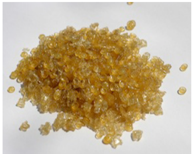
Bone Glue in Pearls

Animal hide and bone glues set in a two part process which first begins by cooling from 145 degrees to room temperature, and then completely drying by evaporation during the next 12 to 24 hours. This allows the traditional woodworker to use this glue to his advantage, since hammer veneering and "rubbed" joints both require a glue with a rapid initial grab as it cools. In addition, the strong initial hold of these glues allows clamps to be removed and reused on another job while the first project dries overnight.