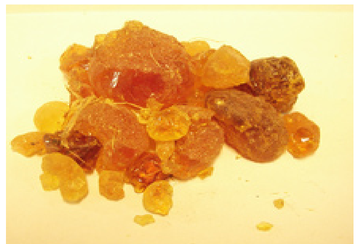
Arabic Gum or Acacia gum

There are two basic types of natural adhesives which are commonly used: animal and vegetable. A wide variety of vegetable glues are derived from starches, gums, cellulose, bitumen and natural rubber, and have specialized applications. Animal glues are derived from casein (a milk protein used in paint), blood albumen (used in plywood), and collagen (used in woodworking). All of these adhesive products are organic in nature and non toxic to humans.