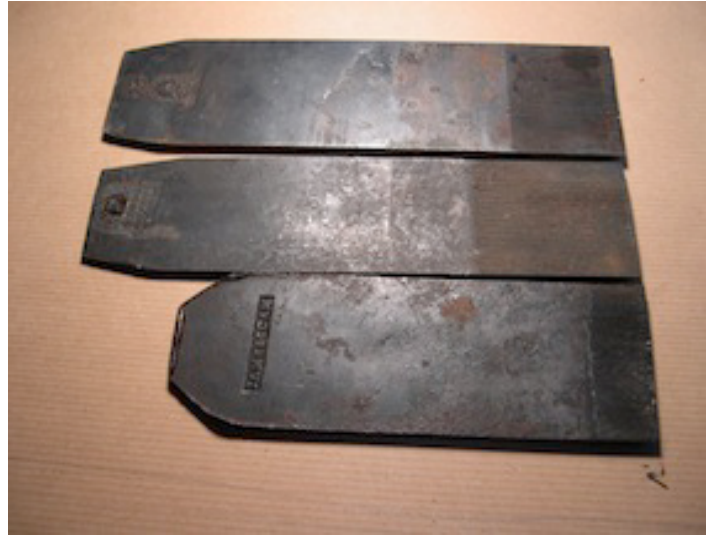
Tothing plane blades

When veneers were first sawn by specialized workers before 1800, the thickness was uneven and the surface rough. A tothing plane was created, which used a toothed iron, set at a scraping angle, to further reduce the veneers in thickness and make the surface more even to glue. At the same time these tothing planes were used to prepare the surface of the groundwork for the veneer, and, if the surface was flat with no defects, the evidence of even tothing marks was said to prove the “truth” of the work. This meant it was ready for