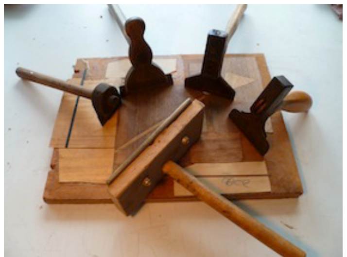
Different types of Veneer Hammers.

Hydrolyzed collagen glues are easily modified with a wide variety of additives. It can be formulated with all water soluble materials, such as sorbitol, glycols, sugars, syrups, metal salts and sulfonated oils. Efforts to make it more water proof have involved using 1% aluminum sulfate, alum (aluminum potassium sulfate), tannins and formaldehyde fumes. KCl (salt) and potash prevent brittleness and crazing over time. A 5% glycerin additive makes the glue flexible enough for canvas backing on tambours. Adding 5-10% or more by weight of urea extends the gel time, and also increases flexibility, producing a liquid hide glue at room temperature.